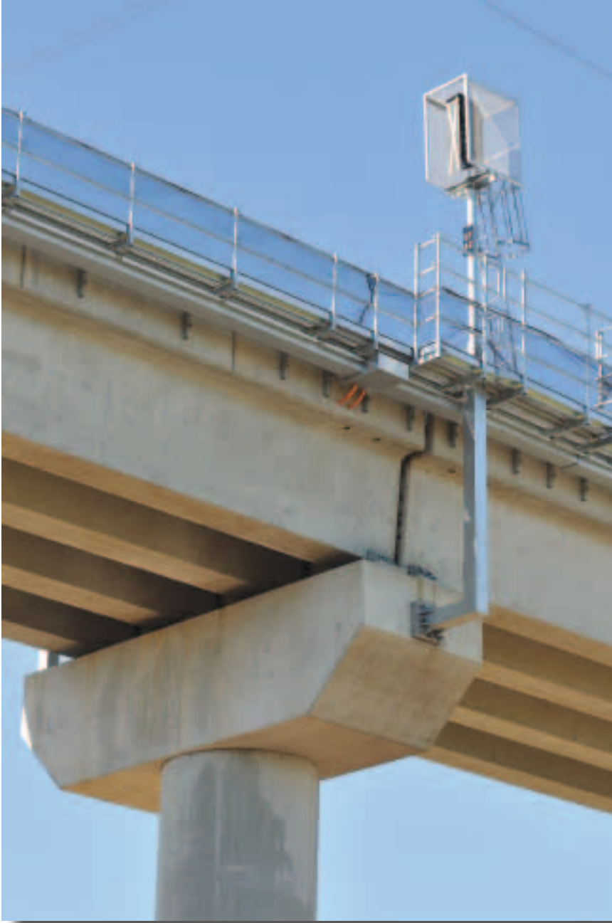
The mounting of Signal SF62 on the viaduct at Johnston Road.