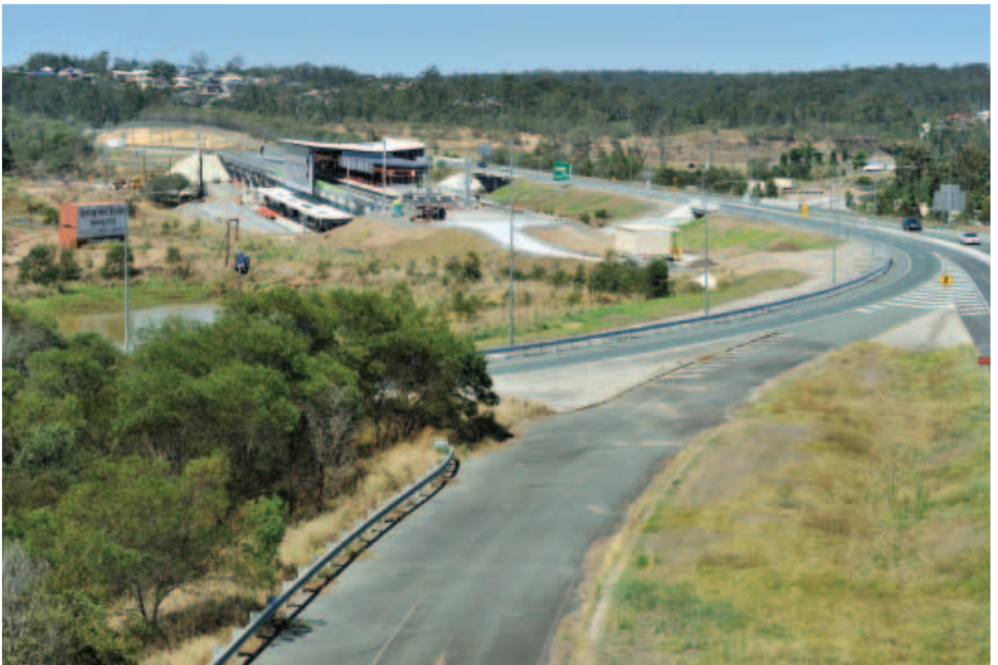
Below: The western side of Springfield Central Station looking towards the east on 7 October. This overview shows part of the Centenary Highway heading west to Ipswich. An extension to the line further west would be likely to go through the green area in the right foreground.