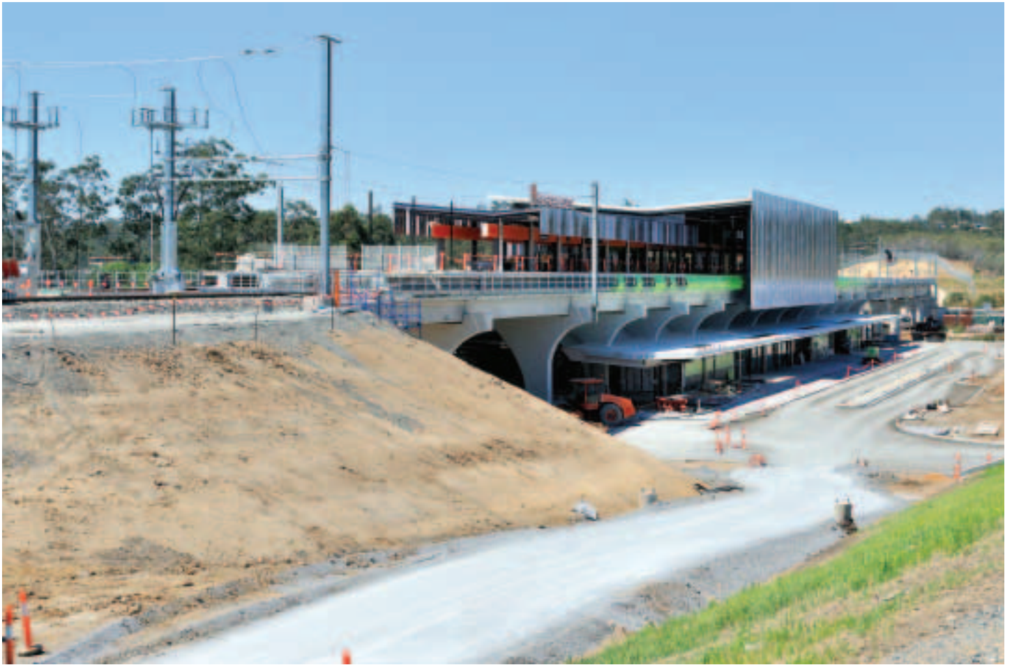
Above: The southern side of Springfield Central Station on the same day as the photograph below.