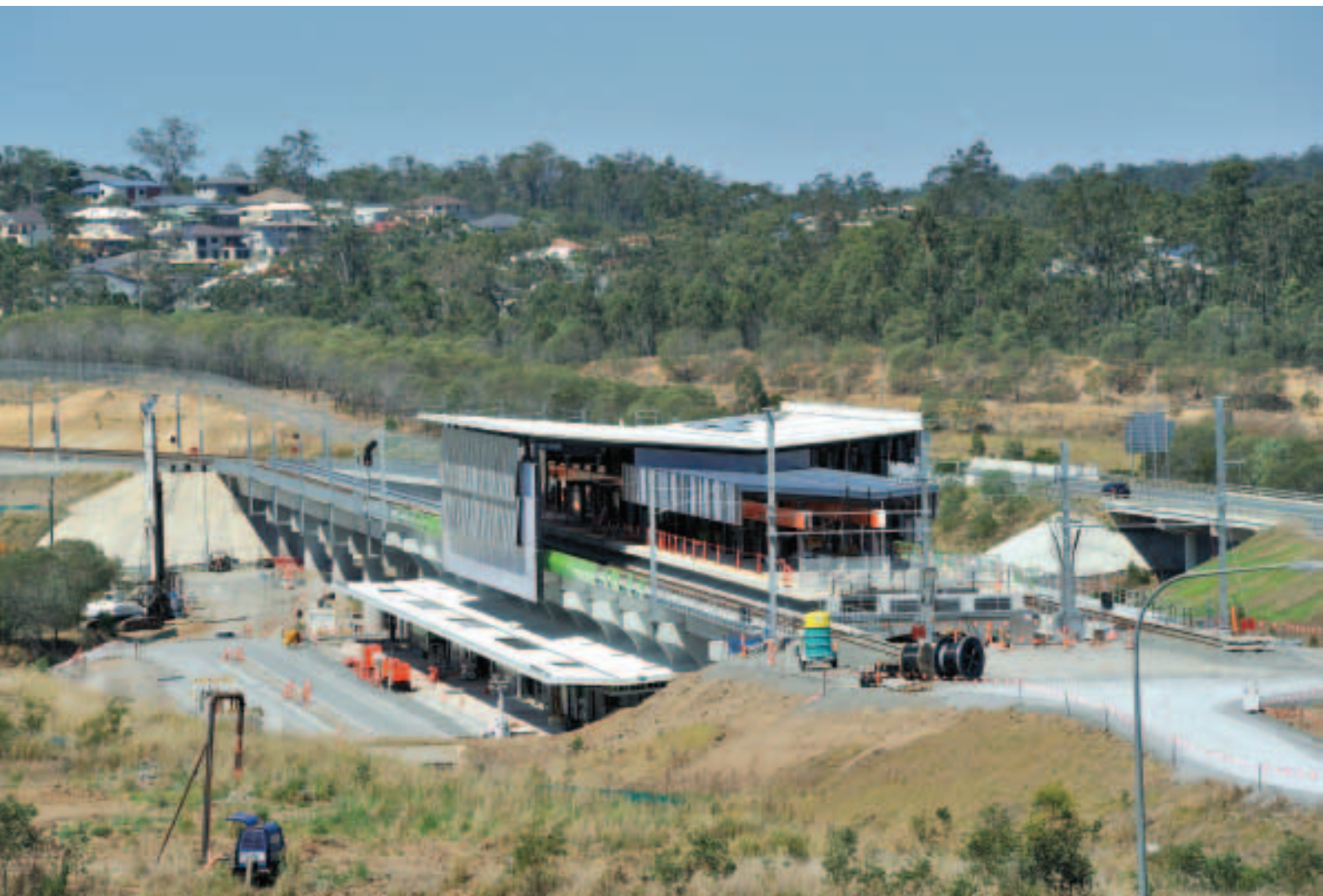
Below: Another view east across the western side of Springfield Central Station on the same date.