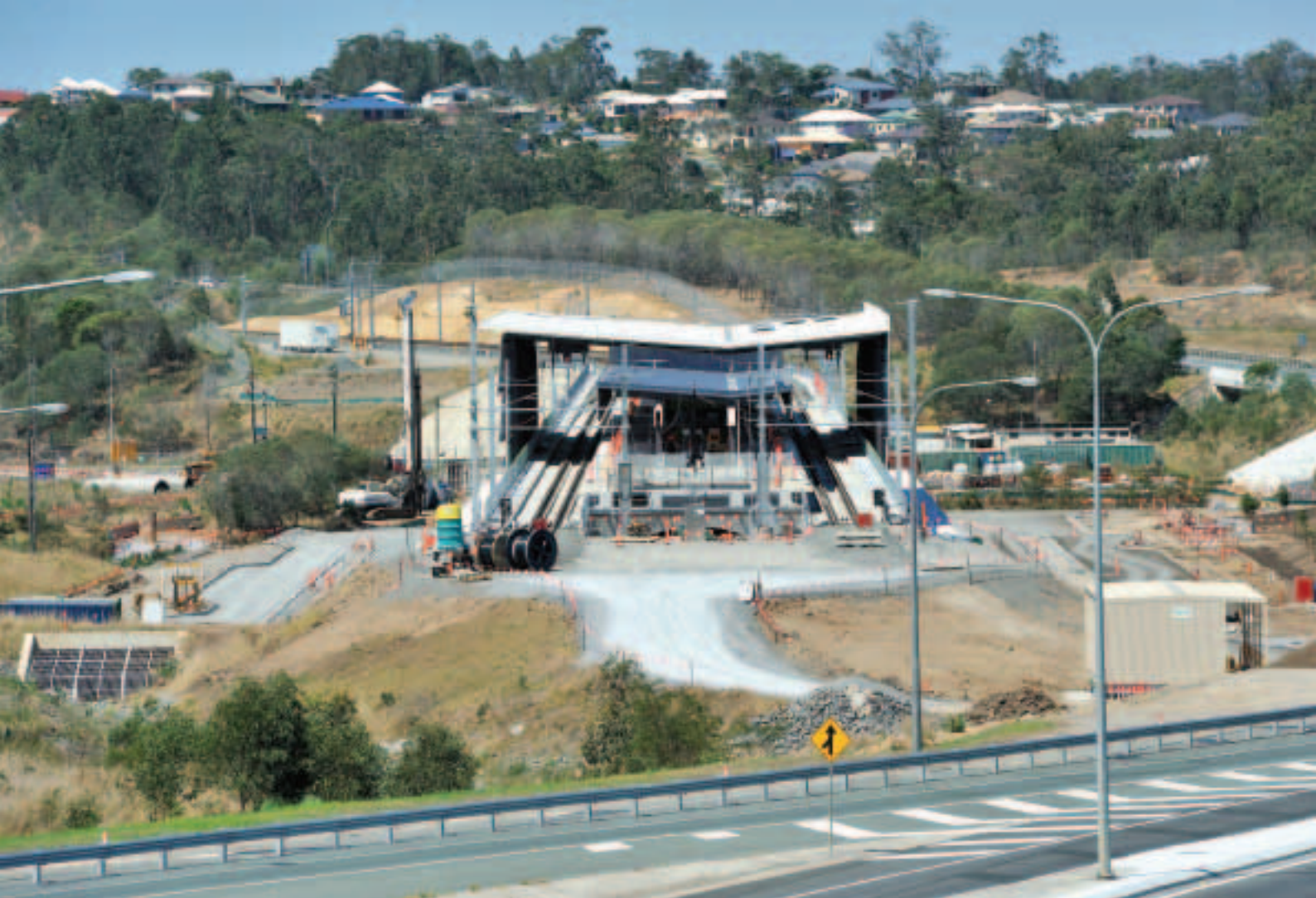
Above: An end on view of the terminus on 7 October.